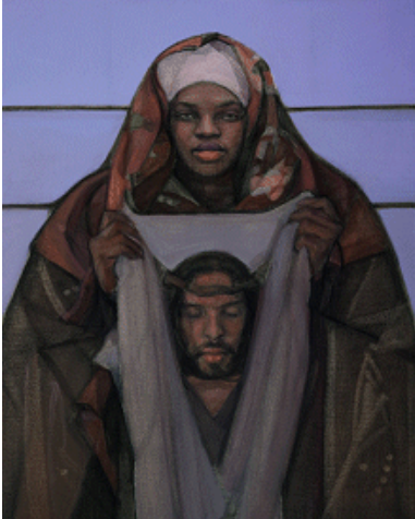
Art: The Stations of the Cross

© 2013 by Janet McKenzie www.janetmckenzie.com